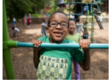
Master's of Public Health Programs (MPH)

The Master of Public Health is the recognized professional degree for leadership careers in public health.