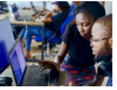
Master of Science Programs (MS)

A practice-orientated public health degree with a focus on infectious tropical disease.