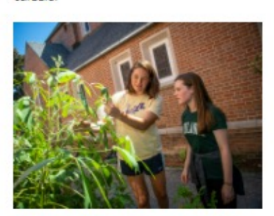
Bachelor of Science in Public Health

An academic degree leading to research careers.